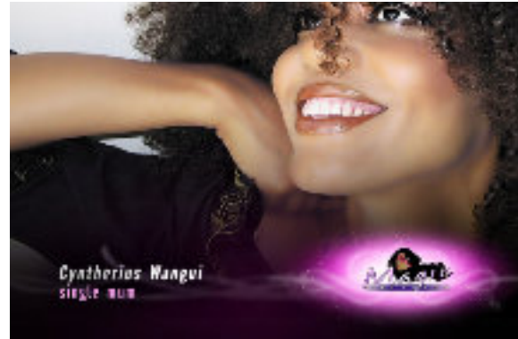
animated lower 3rd slate

the main title is the lasting identity of the brand viewers memory should always appear with the sponsor logo (venus) below and should be positioned centered absolutely on screen. the name title slates have the name on the left and an animation alternating the magic makeover and sponsor's logos.