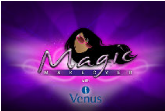
main title rendering